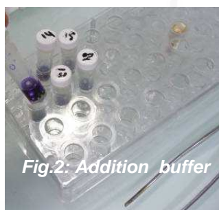
Fig.2: Addition buffer