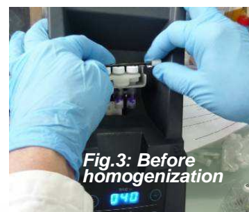
Fig.3: Before homogenization