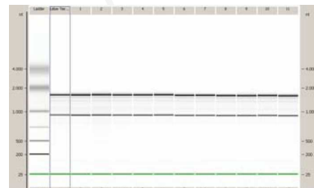
Gel-like image of RNA's isolated using different Precellys ® set-ups